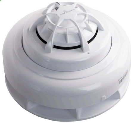
XPA-CB-14019-APO XPander Combined Sounder and Multisensor Detector