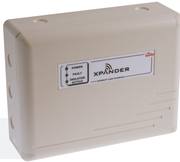
XPA-IN-14050-APO XPander Diversity Loop Interface