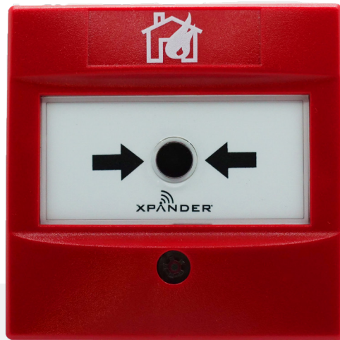
XPA-MC-14101-APO XPander Manual Call Point