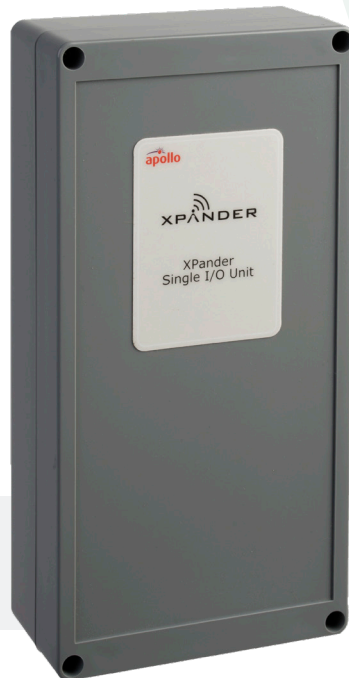
XPA-IN-14011-APO XPander Input/Output Unit