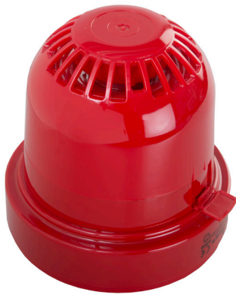
XPA-CB-14001-APO XPander Sounder and Sounder Base