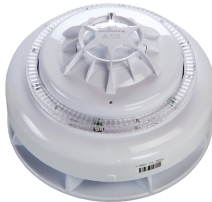
XPA-CB-14025-APO XPander Combined Sounder Visual Indicator (Clear) and Heat Detector (Class A1R)