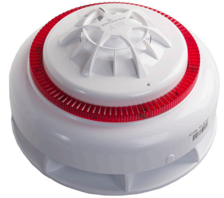
XPA-CB-14021-APO Combined Sounder Visual Indicator (Red) and Heat Smoke Detector