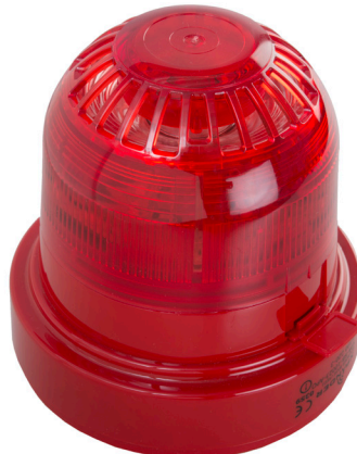
XPA-CB-14003-APO XPander Sounder Visual Indicator and Sounder Base